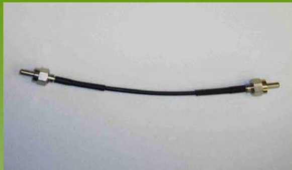
Assembled Cables with Connectors